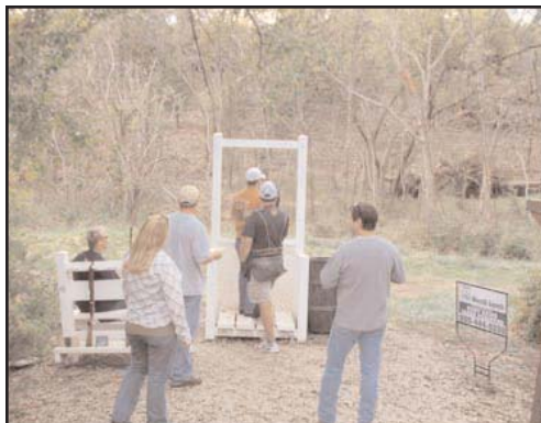
The course at Lenexa's Powder Creek Shooting Club provided the perfect backdrop for an afternoon of camaraderie and sportsmanship.

The Fundraising Committee has received a tremendous amount of positive feedback regarding the event, which may evolve into an annual event for the Post. Thanks to all who participated and helped coordinate the event.