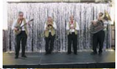
Entertainers at the Ice Breaker