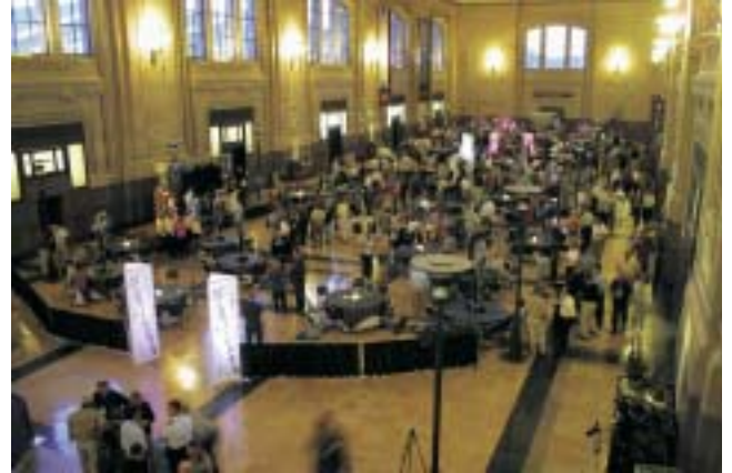
Inside activities at Union Station