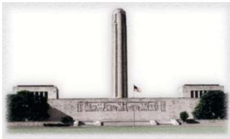
Liberty Memorial Kansas City

and monitor our Post's website for details regarding this field trip. This field trip will be of great interest with respect to the engineering involved in completing the structural repair work to America's only memorial to our soldiers who gave their lives for freedom in WWI.