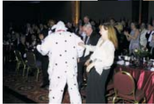
A lighter moment at the Society Ball. "Who said the conference went to the dogs."