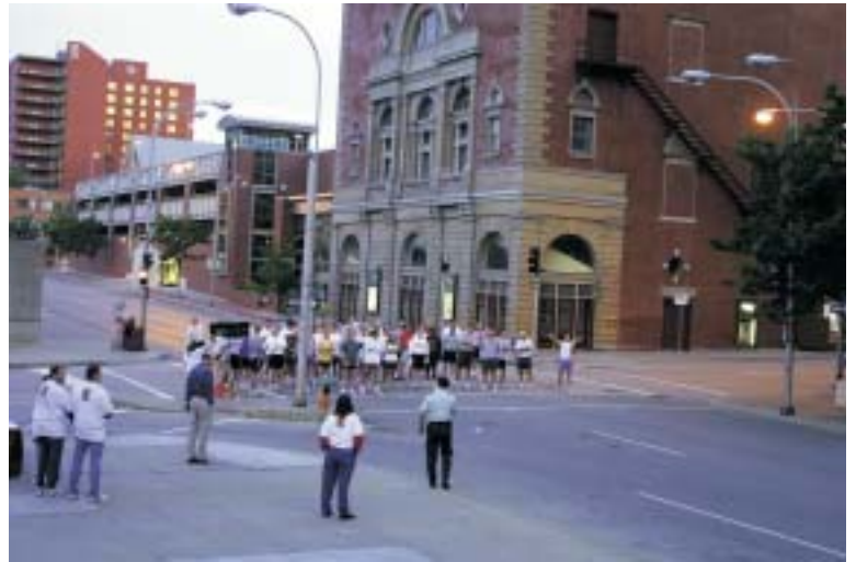
Our fitness conscious SAME members line up to start the Fun Run.