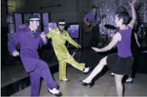
Ice Breaker Entertainment "Give Me That Good Time Rock N' Roll!"