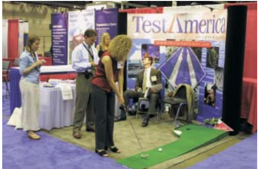
Activities at Test America's booth