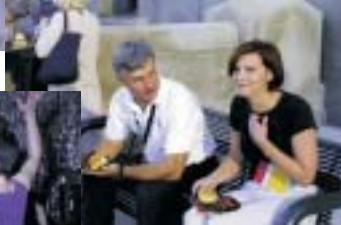
That's Good KC Barbecue