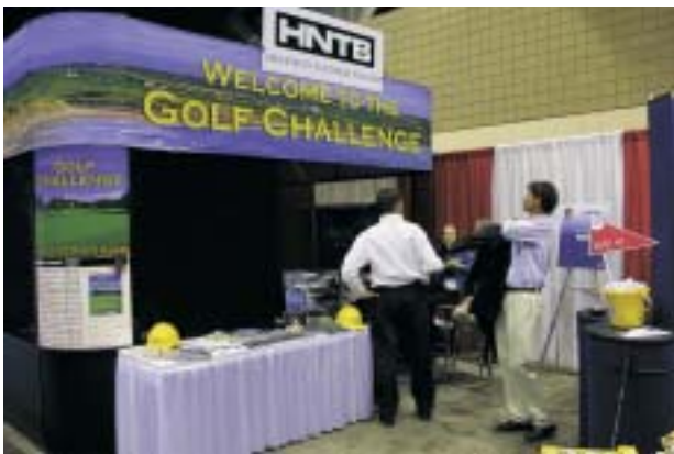
HNTB's Golf Challenge.