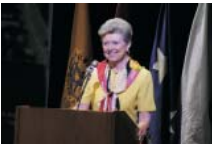
Mayor Kay Barns, Kansas City, MO with Welcome Remarks to Attendees.