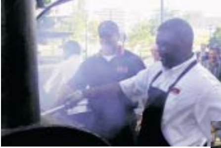
Gates Barbecue firing up their specialty at the Union Station Ice Breaker