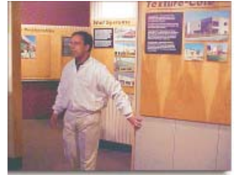
The October meeting was an impressive and educational tour of the Butler Research Center and new Butler World Headquarters.