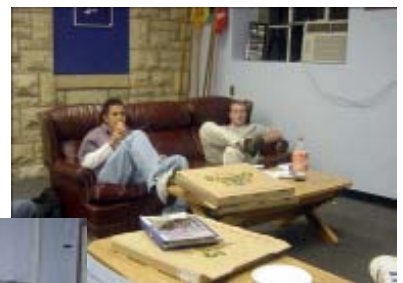
The KU Post meets monthly at the Military Science Building at the University of Kansas.